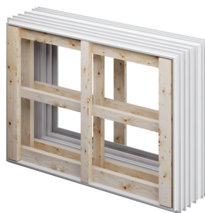
Recommended nail position for external fixing

When stripping the formwork, care must be taken to ensure that the window frame is not damaged by the support frame attached to the wall formwork.